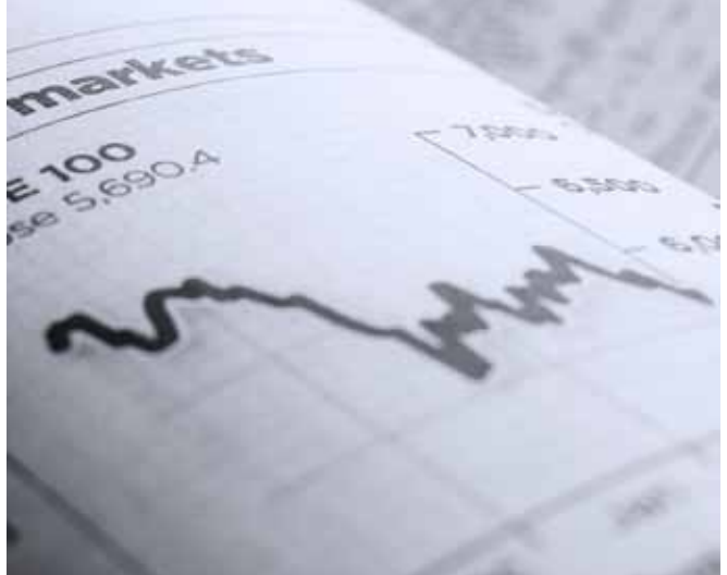
You don't have to have a lump sum in order to invest. Regular savings plans allow you to contribute relatively small amounts of money on a monthly basis and build up a capital sum.

Achieving the right mix of assets should be your first decision and it is a good idea to diversify the types of fund you invest in. No matter what your investment goals are and how much you wish to invest, if you would like us to review your particular situation, please contact us.